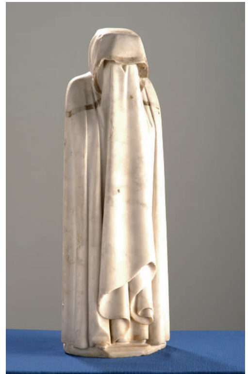
Jean de Cambrai, Mourner of the Duke of Berry , Bourges, Musée du Berry

The exhibition explores the reasons behind the manuscript's international fame, from its creation to the present day, in a display combining literature, visual arts and cinema.