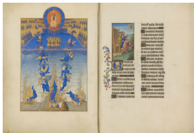
Fall of the Angels in the Très Riches Heures du Duc de Berry, Paris and Bourges, 1411 - 1485