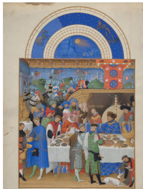
January in the calendar of the Très Riches Heures du Duc de Berry Paris and Bourges, 1411-1485

In December 1855, a manuscript once belonging to Duke Jean of Berry (1340-1416), the son, brother and uncle of kings of France, resurfaced in Genoa. When he learned of the manuscript, the Duke of Aumale (1822-1897) instantly grasped its importance, purchased it and hired the leading experts of the day to begin a study of it. Completing this fascinating survey, major works from the same workshop will also put this unparalleled production within its broader context.