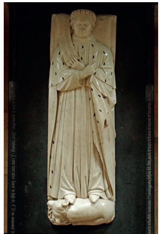
Jean de Cambrai, Tomb effigy of the Duke of Berry, Cathedral of Bourges