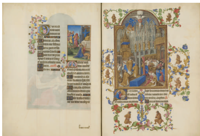
Christmas Mass in the Très Riches Heures du Duc de Berry, Paris and Bourges, 1411 - 1485

The restoration, performed with the expert help of leading specialists, offered an unparalleled opportunity to scrutinise the work, revealing each stage of its creation, down to the smallest brushstroke. An audiovisual presentation will bring to life these extraordinary findings and scientific images from analyses produced by the C2RMF.