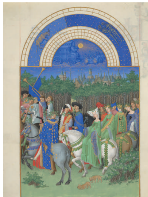
May in the calendar of the Très Riches Heures du Duc de Berry Paris and Bourges, 1411 - 1485

Since its acquisition by the Duke of Aumale and his commissioning of early reproductions of the work, the book has gained international acclaim as a masterpiece of medieval art. It continues to shape a romanticised and idealised vision of the Middle Ages in the popular imagination.