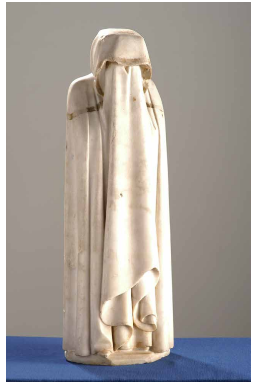
Jean de Cambrai, Mourner of the Duke of Berry , Bourges, Musée du Berry

The exhibition explores the reasons behind the manuscript's international fame, from its creation to the present day, in a display combining literature, visual arts and cinema.