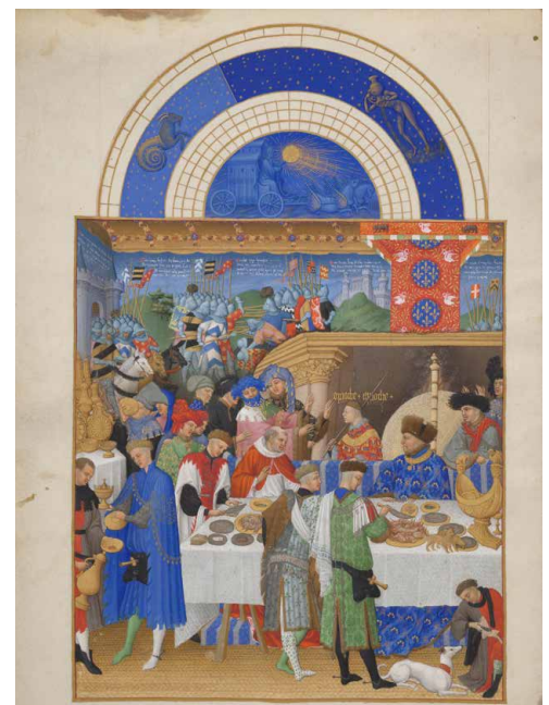
January in the calendar of the Very Rich Hours of the Duke of Berry Paris and Bourges, 1411-1485

In December 1855, a manuscript once belonging to Duke Jean of Berry (1340-1416), the son, brother and uncle of kings of France, resurfaced in Genoa. When he learned of the manuscript, the Duke of Aumale (1822-1897) instantly grasped its importance, purchased it and hired the leading experts of the day to begin a study of it. Completing this fascinating survey, major works from the same workshop will also put this unparalleled production within its broader context.