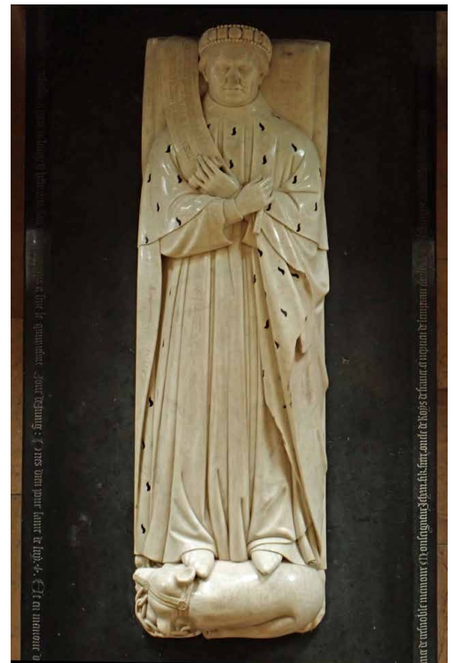
Jean de Cambrai, Tomb effigy of the Duke of Berry, Cathedral of Bourges