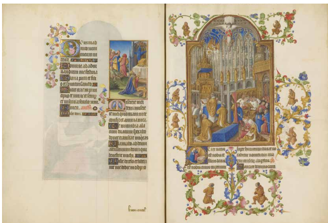
Christmas Mass in the Very Rich Hours of the Duke of Berry, Paris and Bourges, 1411 - 1485

The restoration, performed with the expert help of leading specialists, offered an unparalleled opportunity to scrutinise the work, revealing each stage of its creation, down to the smallest brushstroke. An audiovisual presentation will bring to life these extraordinary findings and scientific images from analyses produced by the C2RMF.