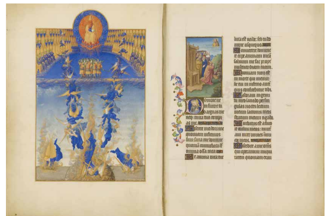
Fall of the Angels in the Very Rich Hours of the Duke of Berry, Paris and Bourges, 1411 - 1485